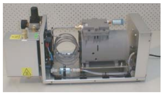
8301LC Zero Air Generator

^{\rm o} portable version can be optioned with a HCS-1000 fitted to the end